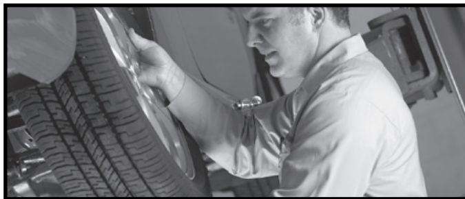
Michelin Tires Mail-in Rebate

The product(s) purchased and dealer-installed on my vehicle between May 31, 2010, and August 29, 2010, include: