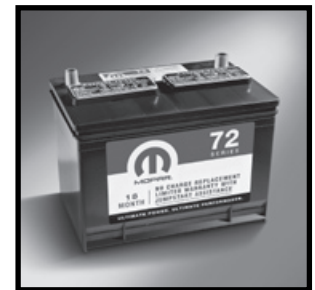
Mopar Battery Mail-in Rebate